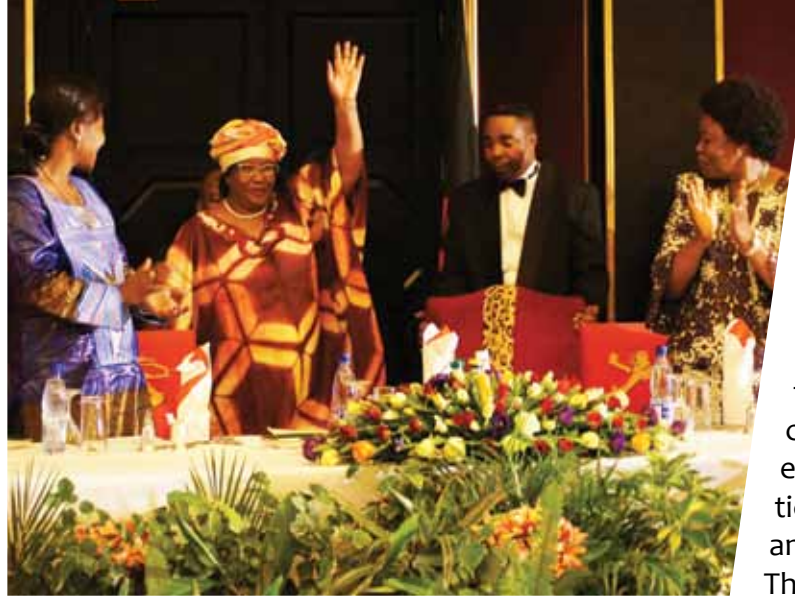
Regional Conference for African Women in Political Leadership

FEMNET also coordinated a high level mission to Cameroon with the Special Rapporteur on the Rights of Women in September 2012. The goal was to lobby the government to deposit their instrument of ratification, and support Cameroonian CSOs to plan for joint advocacy on implementation of the Protocol. As a result of the mission, Cameroon deposited its instrument with the AU Commission in January 2013. Cameroonian CSOs also agreed on a joint advocacy strategy on popularization and implementation of the Protocol.