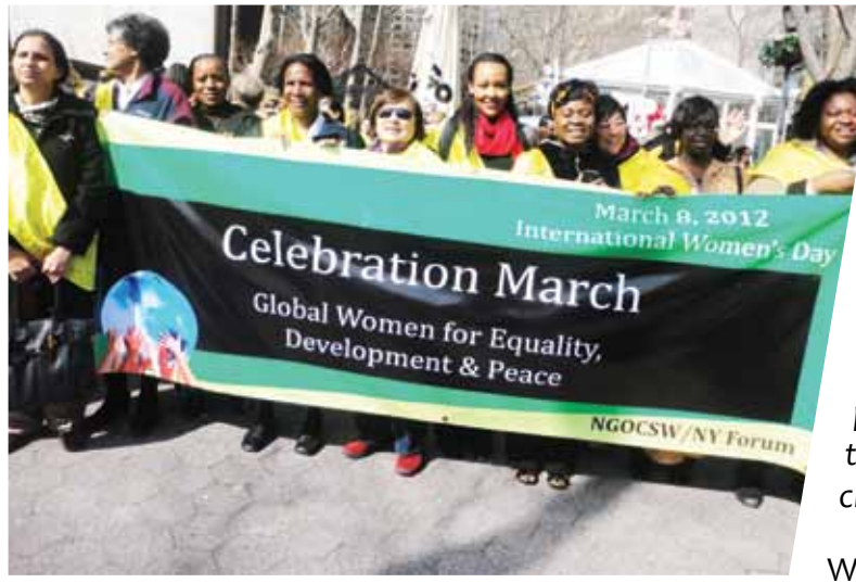
FEMNET @ UN-CSW in New York