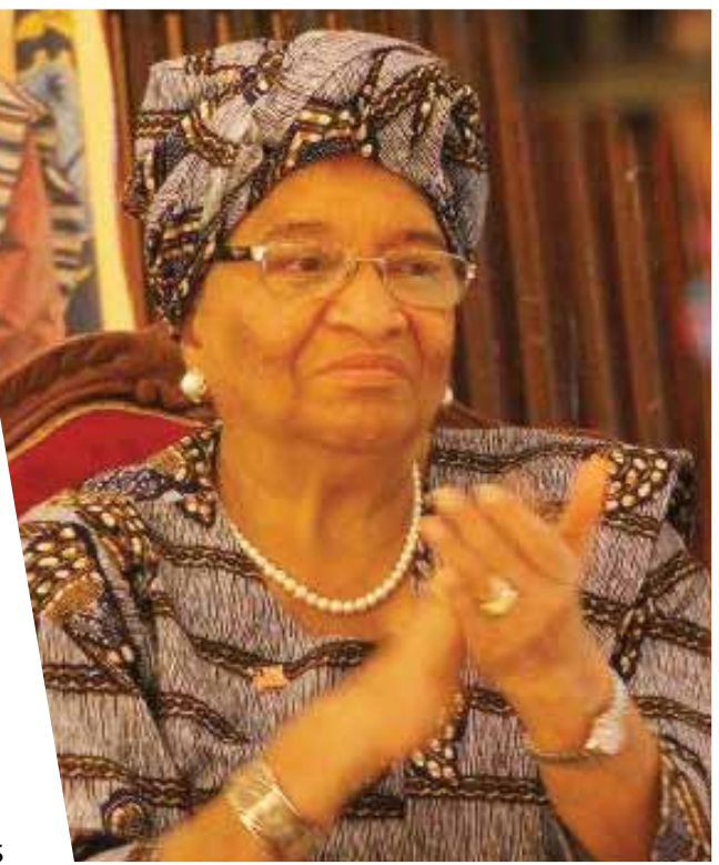
H.E. Ellen Johnson Sirleaf, President of Liberia

A Pan African alliance which includes FEMNET, Pan Africa Climate Justice Alliance Beyond 2015, GCAP, ACORD International, Oxfam and African Monitor with support from the UN Millennium Campaign was formed in early 2012 to ensure the next agenda was not prescriptive, but one that reflects Africa's