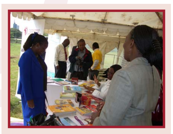
Visitors at FEMNET's Exhibition booth during the Kenya Gender Festival, 2009

In line with the 2008-2012 Strategic Plan which emphasises on focussing on bridging the existing gap between FEMNET regional and international level activities with the national and grassroots programmes of its national focal points and other partners, FEMNET actively participated in the 2009 first ever Kenya Gender Festival (KGF). Throughout the first part of the year FEMNET participated in the intensive preparations of the KGF that was held in June 2009. The KGF is an open forum that brought together feminist and gender-focused groups, other civil society organizations, activists and development partners working at various levels to reflect, share experiences, build capacity, strategize and plan collectively in building a better Kenya for women. The KGF will be an annual event which is aiming at building a stronger women's movement in Kenya. It is a platform where different feminist and women