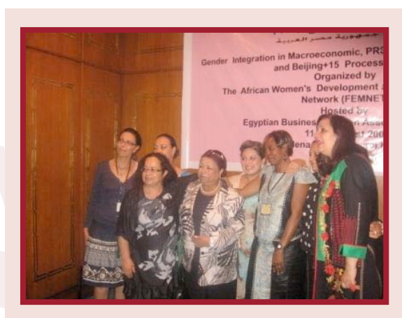
Group photo of the participants at the Post-CSW Debriefing meeting for North held in Cairo, Egypt

In August 2009 the third post- CSW debriefing meeting was held for Northern African countries. The meeting took place in Egypt and it was co-hosted with the Egyptian Business Women's Association. The one day meeting was attended by 30 representatives from Tunisia, Morocco, Algeria, Mauritania and Egypt. Those invited from Libya were not able to attend. Despite limitations of resources FEMNET was determined to reach as many women as possible in the Africa region with information about the Beijing + 15 Review process and the outcomes of CSW 53rd Session on equal sharing of responsibilities between men and women as one of the strategies for achieving equality and women's empowerment. gender Therefore, the North Africa meeting was held back to back to that of the training of trainers for the gender mainstreaming in national macroeconomic policies