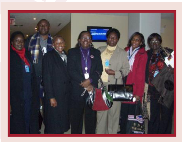
African women representatives at the 53<sup>rd</sup> Session of the UN CSW

The 2009 UN Commission on the Status of Women (CSW) 53rd Session, was held in New York from March 2-13, 2009. The CSW is the pre-eminent global policy forum within the United Nations (UN) that is addressing issues affecting women's empowerment and their rights, and the monitoring of the implementation of the Beijing Platform for Action. UN member states meet at the annual CSW session to deliberate on a priority theme, resulting in Agreed Conclusions that are submitted to the UN General Assembly through the UN Economic and Social Council (ECOSOC). Civil society organizations have an opportunity to participate in the open sessions of the CSW, and to organize parallel events focused on the priority theme or any relevant aspect of their work. They can also present oral statements to the