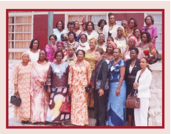
Group photo of the participants at the Leadership conference in Lome, Togo

FEMNET convened this Conference with a view to: Improve the level of awareness on and appreciation of the role that women play and can /should play in